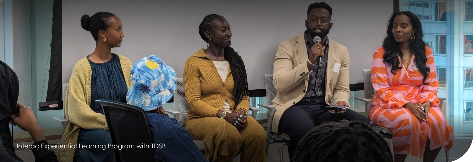
Interac Experiential Learning Program with TDSB

In 2023, we enhanced our quiet room with prayer mats, introduced all-gender bathrooms on multiple floors of the Toronto office and offered every employee a free subscription to Headspace to support their mental health and well-being.