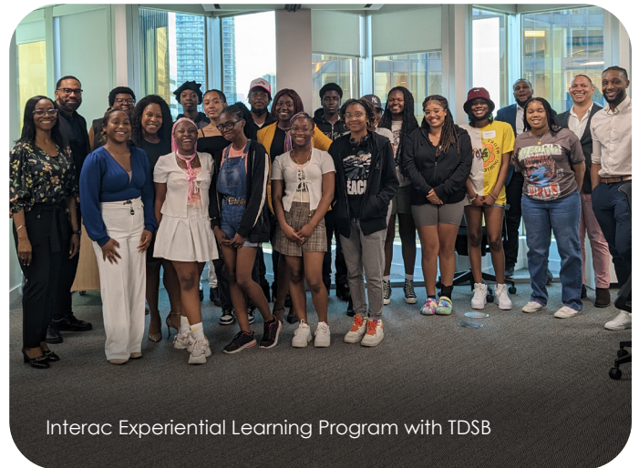
Interac Experiential Learning Program with TDSB

We continue to participate in TDSB's Black Summer Student Leadership program . To date, over 20 Black students have spent their summers as Interac interns to build their confidence and work skills.