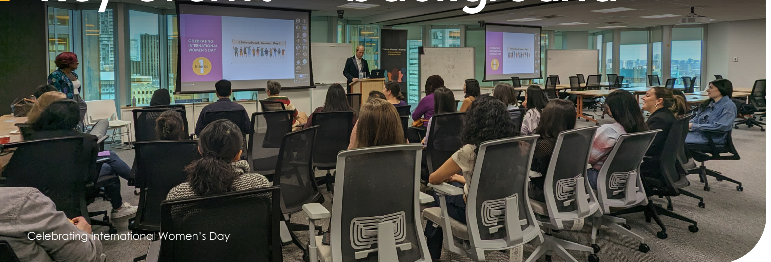
Celebrating International Women's Day

Promoting DEI at Interac is a continuous effort. The past and ongoing activities highlighted below have set the stage for successful activities in 2023 and 2024