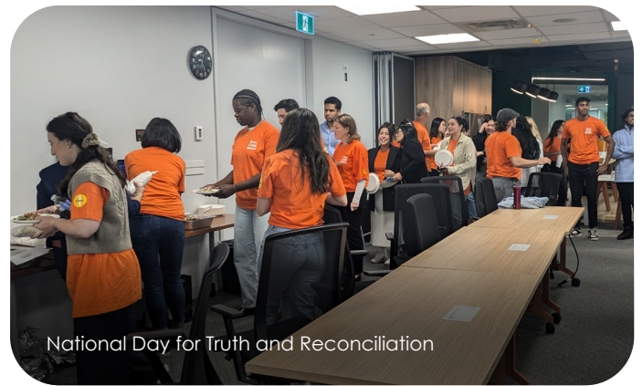
National Day for Truth and Reconciliation

Finally, in 2024, because equity and inclusion are integral to our culture and decision-making at Interac, we made a commitment that each Town Hall will begin with a focus on DEI — for example, by sharing key data or highlighting our activities.