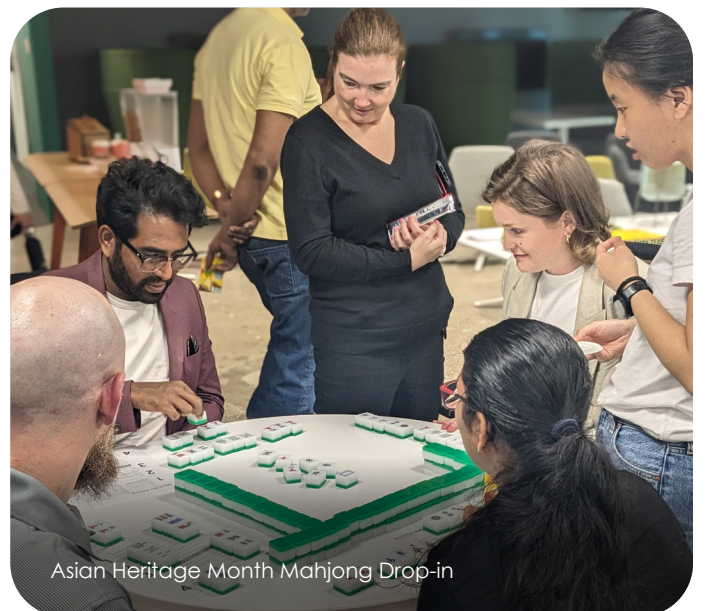
Asian Heritage Month Mahjong Drop-in