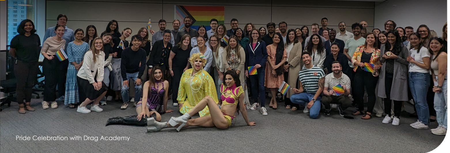
Pride Celebration with Drag Academy