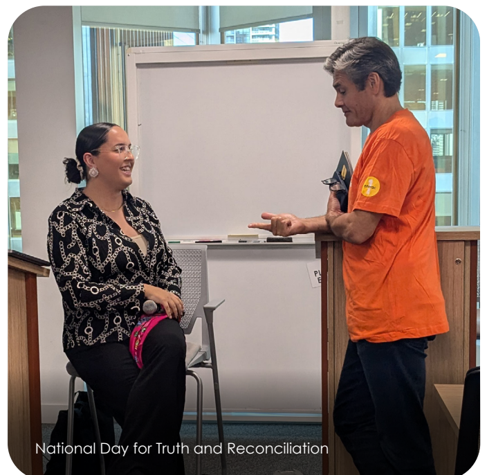
National Day for Truth and Reconciliation