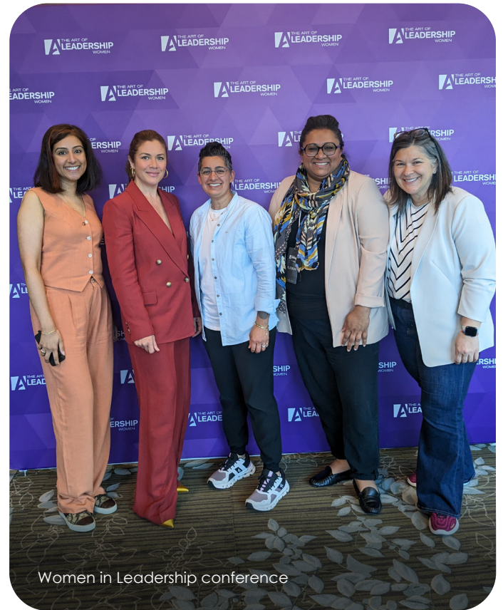
Women in Leadership conference

Our 2023 Pride Season featured discussions on allyship and intersectionality in partnership with Drag Academy . We also updated our Pride logo to reflect the Pride Progress flag and included intersex identities. And in our Pride at Work Workplace Audit — which helps organizations track their diversity and inclusion efforts in a comprehensive fashion with respect to sexual orientation, gender identity and gender expression — Interac scored 59% on the audit, compared to the 2023 benchmark average of 37%.