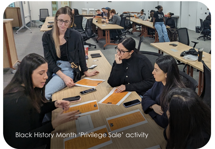
Black History Month 'Privilege Sale' activity

We celebrated Lunar New Year in-office in 2023. In 2024, we welcomed two new employee resource groups: the South Asian ERG and the East Asian ERG , each celebrating the diverse interests of each community and supporting our overall diversity and inclusion at Interac.