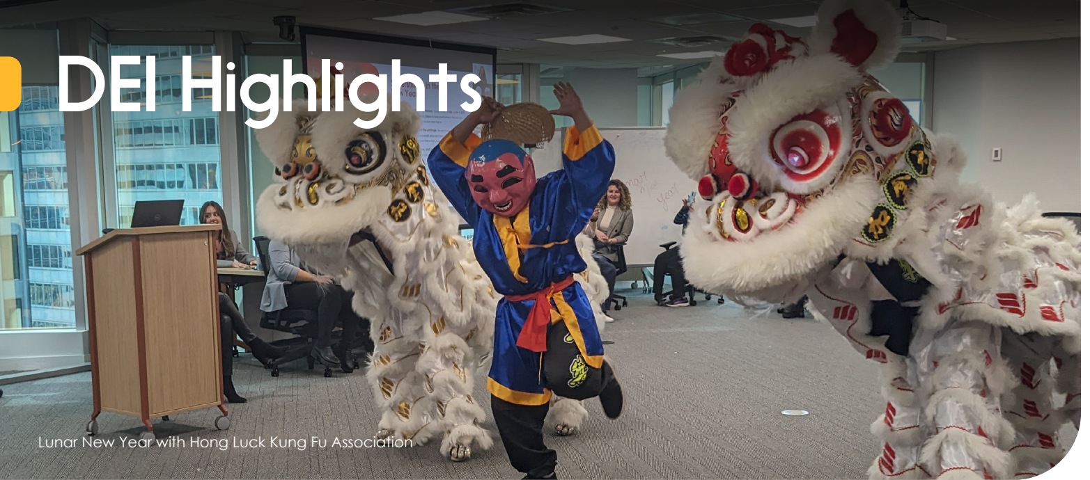
Lunar New Year with Hong Luck Kung Fu Association